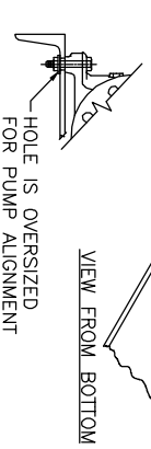
PUMP SUPPORT DETAIL